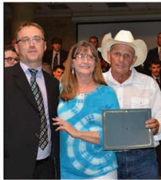
Diploma in hand...