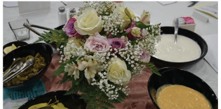
Sometimes you have to stop and smell the roses...