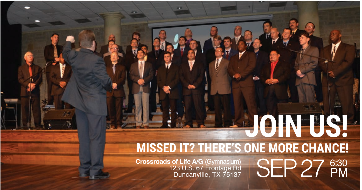
Bringing a word...