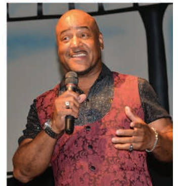
Bringing Good News...